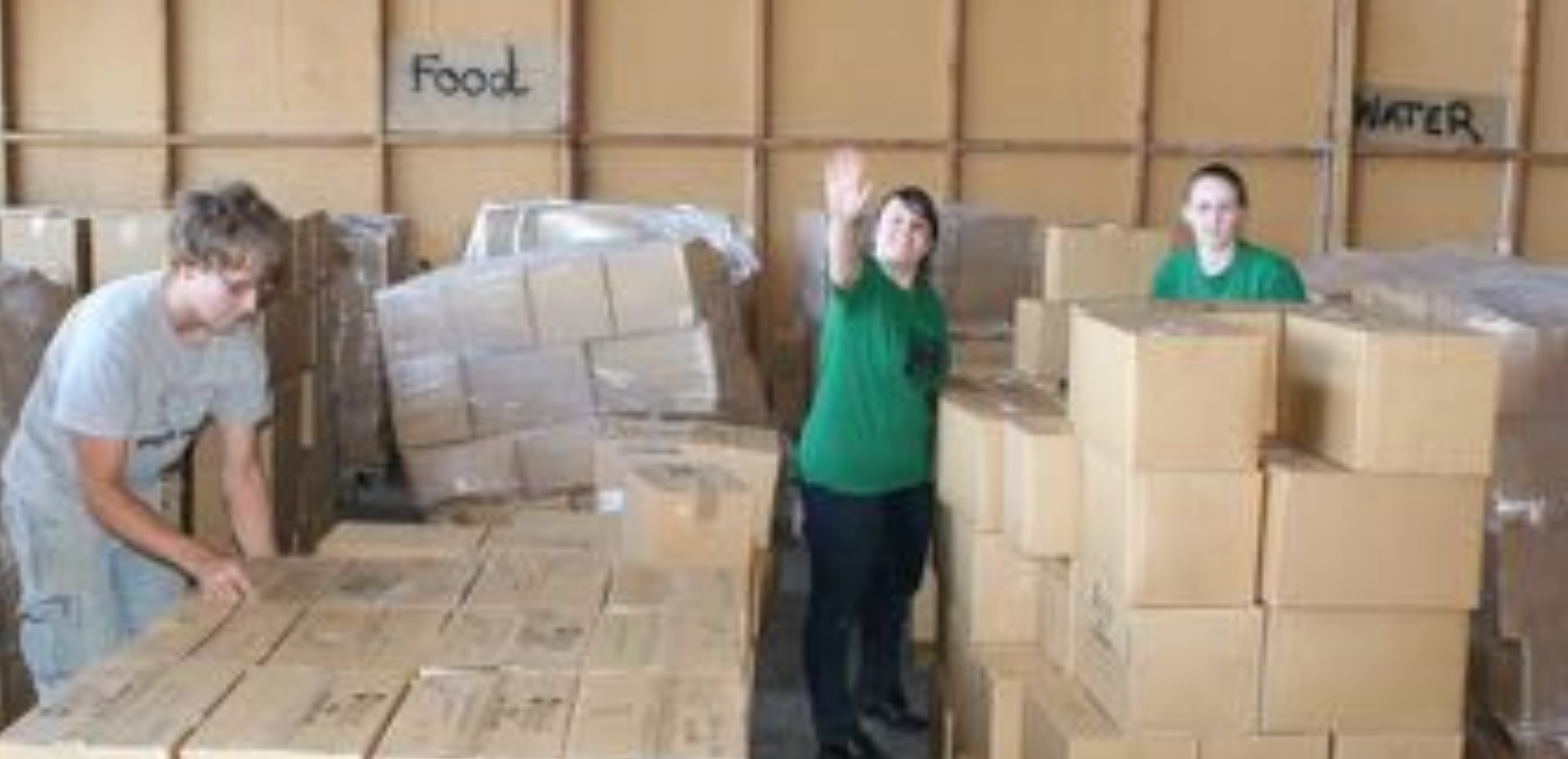
Warehouse x 2